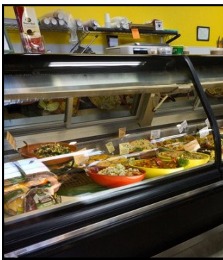
Choose from a selection of fresh deli items.