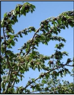
A cherry tree at the Cadwallader Orchard.