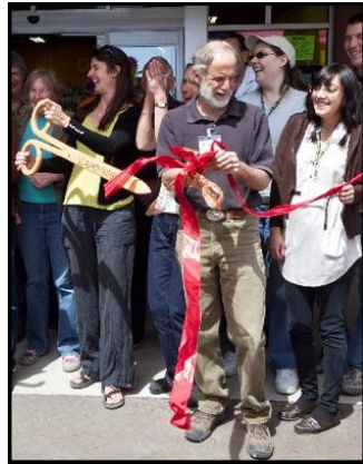
Ribbon cutting at the Co-op's Grand Opening on April 16, 2011.