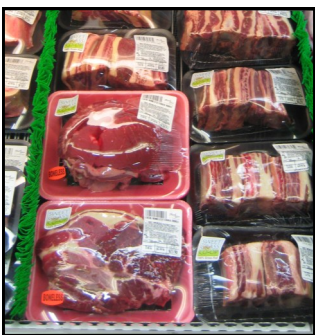
Dozens of different cuts of meat are available.